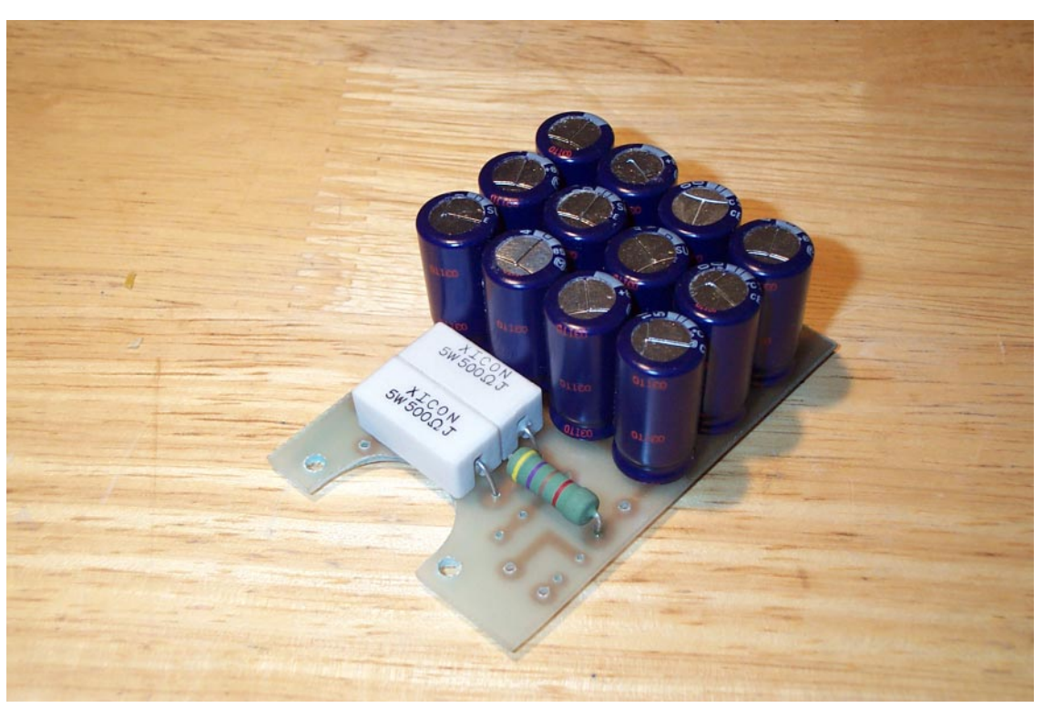
Dyna FM3 Power Supply Capacitor Board