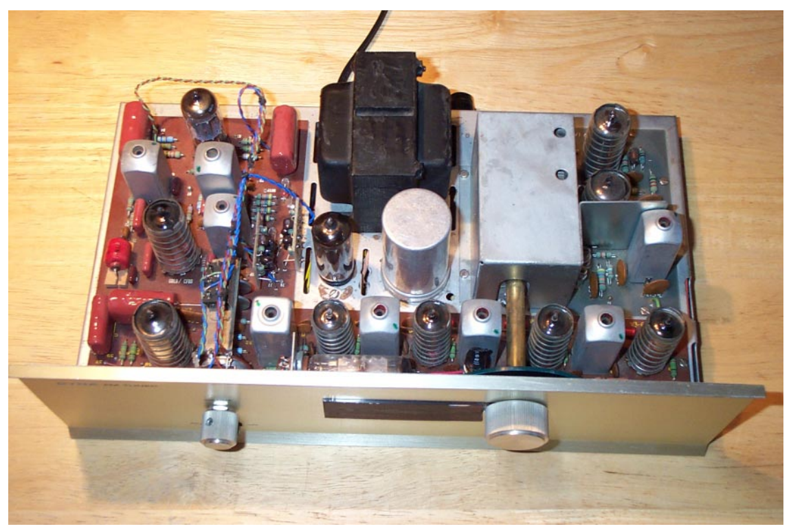
Stock Dyna FM3 Tuner