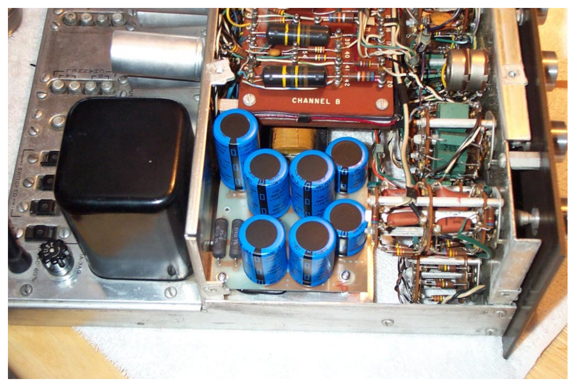
Capacitor Board Installed in Amplifier