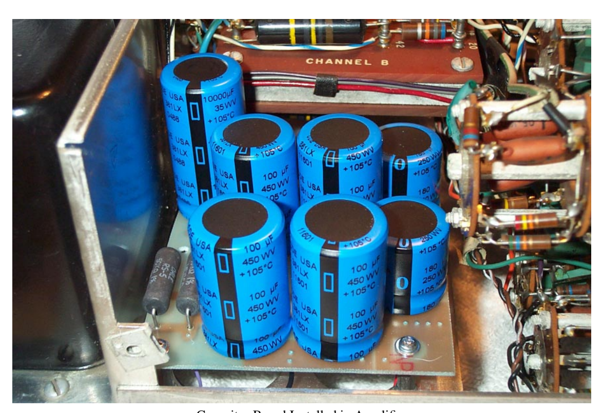
Capacitor Board Installed in Amplifier