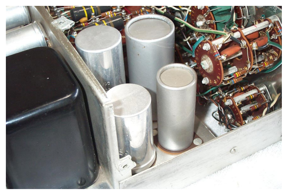
Original Can Capacitors