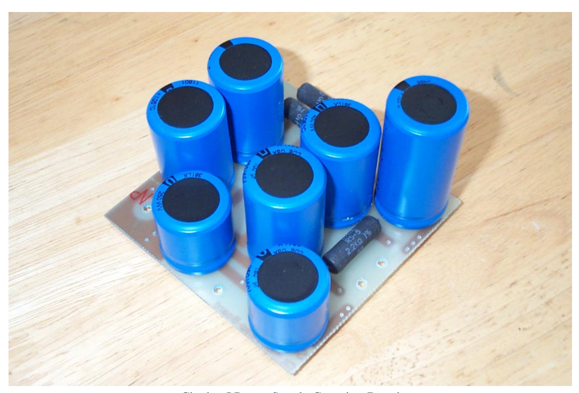
Citation I Power Supply Capacitor Board